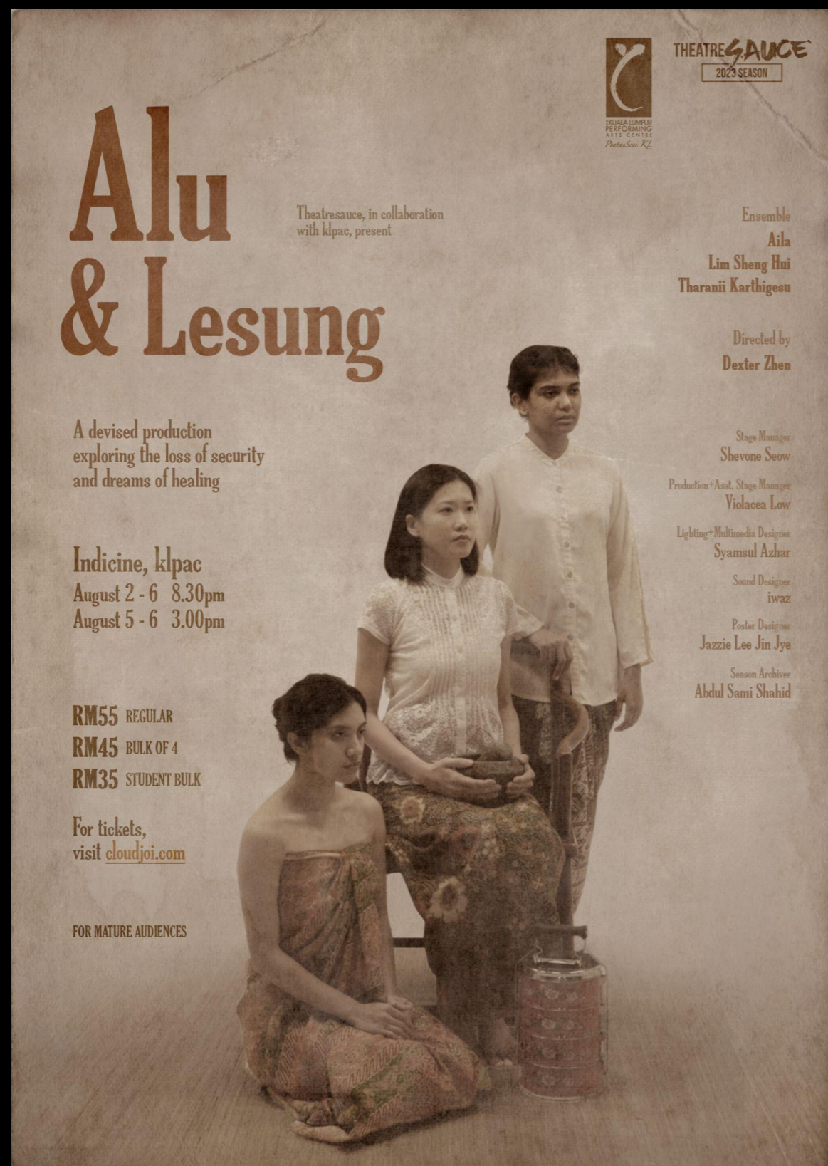
Alu & Lesung August 2-6